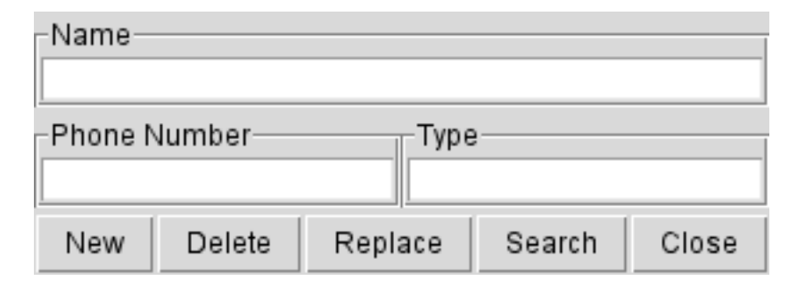
Figure 6: simple GUI with layout info

The editTable widget requires that the SQL schema follow strict rules and a field which references another table must include a references clause.